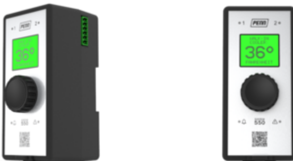
Figure 1. C550CCN module